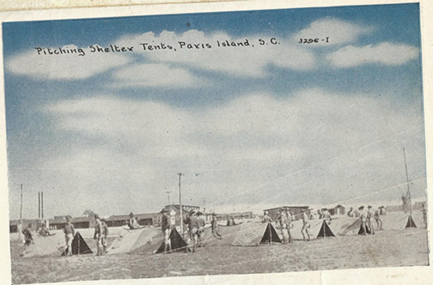
Pitching Shelter Tents, Paris Island, S.C. 3296-1