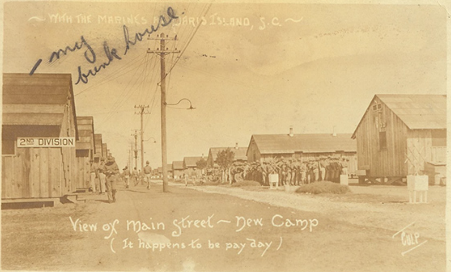
View of main street ~ New Camp ( It happens to be pay day )

~ WITH THE MARINES AT JARVIS ISLAND, S.C. ~ my bunk house.